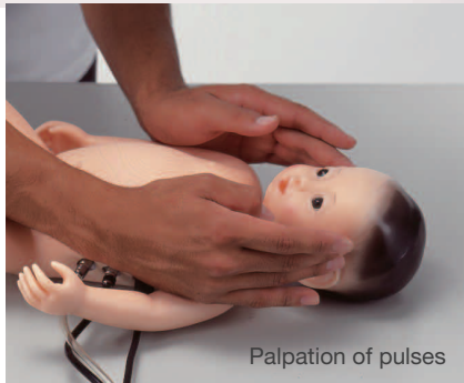
Palpation of pulses