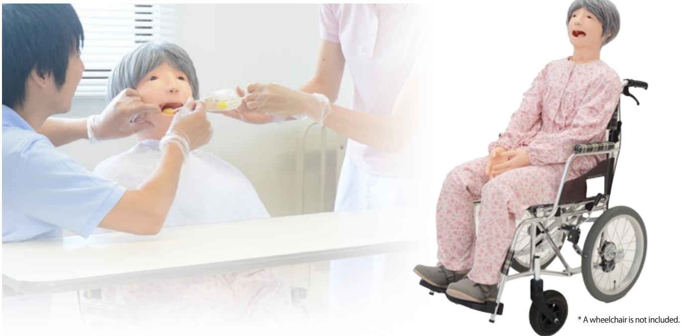
* A wheelchair is not included.